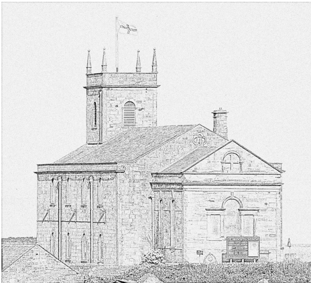
Moresby, St Bridget