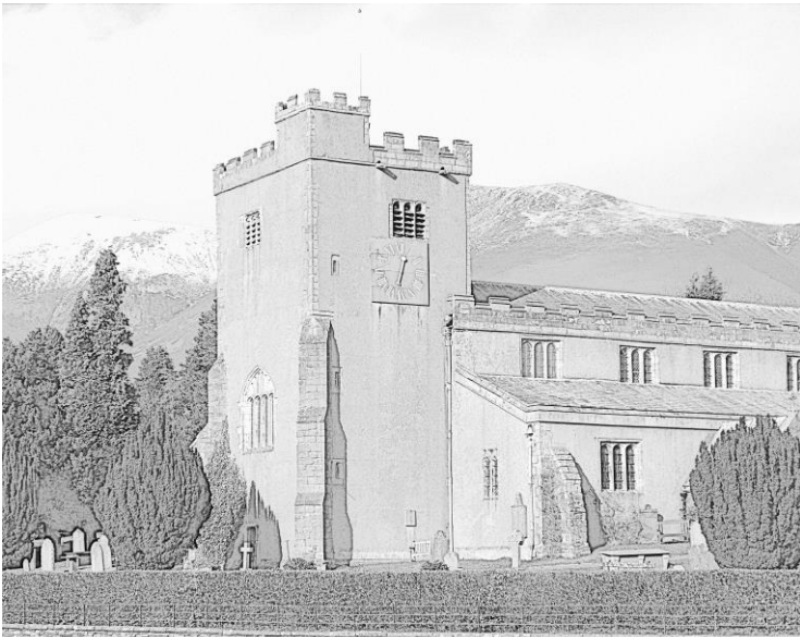
St Kentigern, Crosthwaite, Keswick